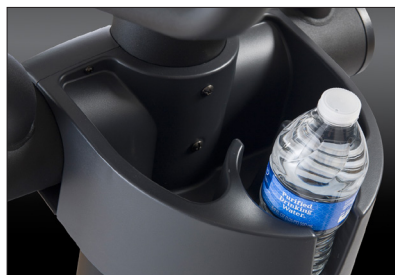
Large cup & accessories holder