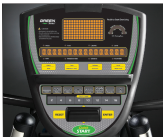
Intuitive, LED console with reading rack/tablet holder