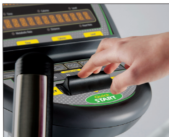
Easy to use touchpad with quick resistance shifter