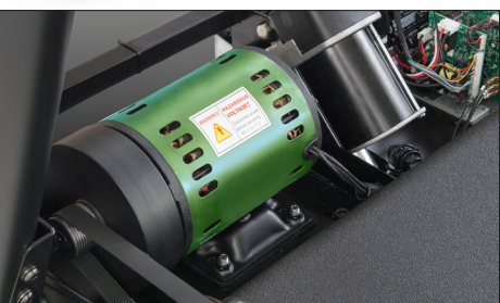
4.25 HP AC High-efficiency drive system