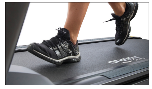
25,000 Mile maintenance-free running belt