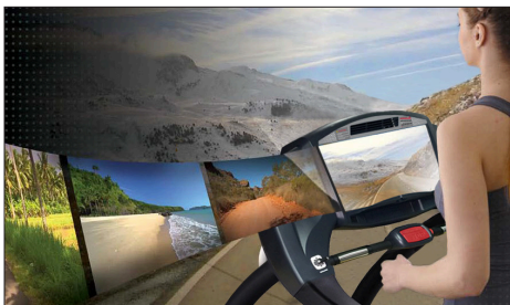
Intuitive, easy-to-use touchscreen console with Virtual Connect™ scenic videos