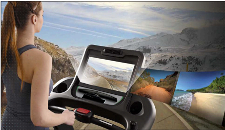
Intuitive, easy-to-use touchscreen console with Virtual Connect™ scenic videos