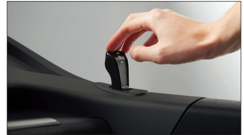
Quick speed & elevation paddle shifters