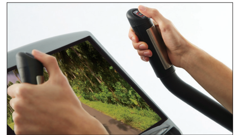
Easily adjust resistance with the push of a button