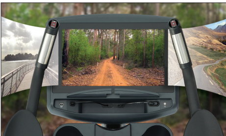
Intuitive, easy-to-use touchscreen console with Virtual Connect™ scenic videos