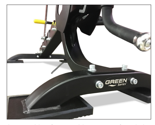
Large rubber feet provide a secure foundation and prevent unit from slipping