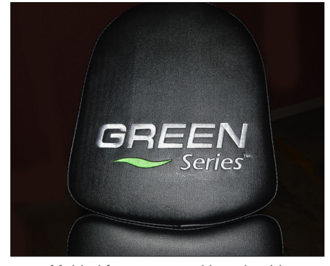
Molded foam wrapped in a durable upholstery provides superior comfort