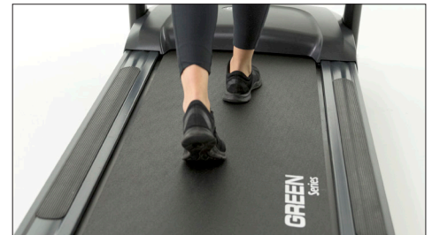
Siegling premium lubricant-infused running belt provides long lasting reliability (made in the USA)