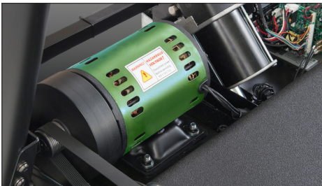
Efficient & powerful 4.25 HP, AC NextGEN III Eco-Drive System™ NEMA IE3 Premium