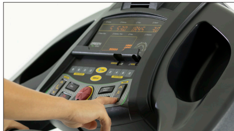
Intuitive, easy-to-use console with reading rack/tablet holder & raised shifters for speed & elevation