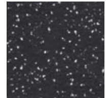
Grey - 10% ECO-EL-02