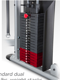
Standard dual 150 lbs. weight stacks upgradable to 200 lbs.