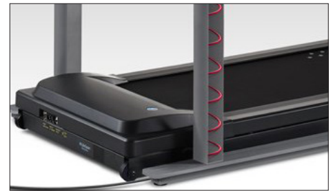
Internal Cable Management