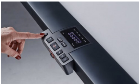
Convenient, easy-to-use desktop console