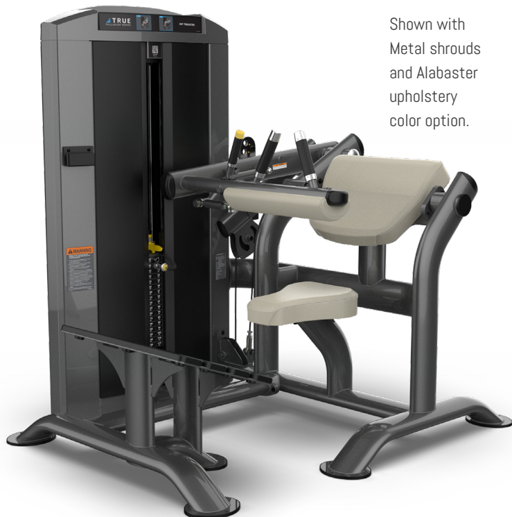
Shown with Metal shrouds and Alabaster upholstery color option.